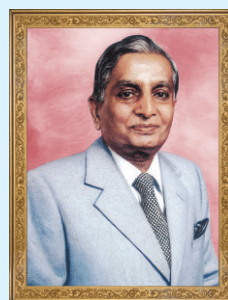
Sri Madhav Prasadji Birla (1918 - 1990)

This Scholarship Scheme will award around 25 successful aspirants a sum of ₹ 24,000/- each per year towards meeting their expenses in the form of tuition fees, boarding and mess charges and on study materials and shall remain valid for the entire duration of their course, but not exceeding 4 (four) years. At its full strength, the Trust will disburse ₹ 24,000/- to 100 aspirants each year, i.e. 25 each in the First, Second, Third and Fourth year of their respective courses, wherever applicable. The final decision on distribution of scholarships shall be reserved with the Madhav Prasad Priyamvada Birla Apex Charitable Trust which can, at any point of time, change the number of recipients and/or the amount of Scholarships or discontinue the Scholarship Scheme without assigning any reasons.